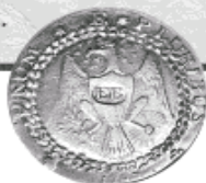
Unique, 1787 "EB" on breast Brasher Doubloon from The Gold Rush Collection