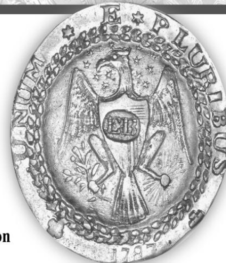
Unique 1787 "EB" on breast Brasher Doubloon from the Gold Rush Collection